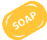
One bath sized bar of soap in the wrapper