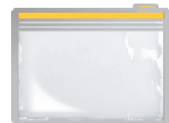
One Gallon Zip Lock Bags for packaging

Please bring donated items to the Church Community Center by March 24.