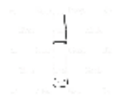
One tube Lip Balm